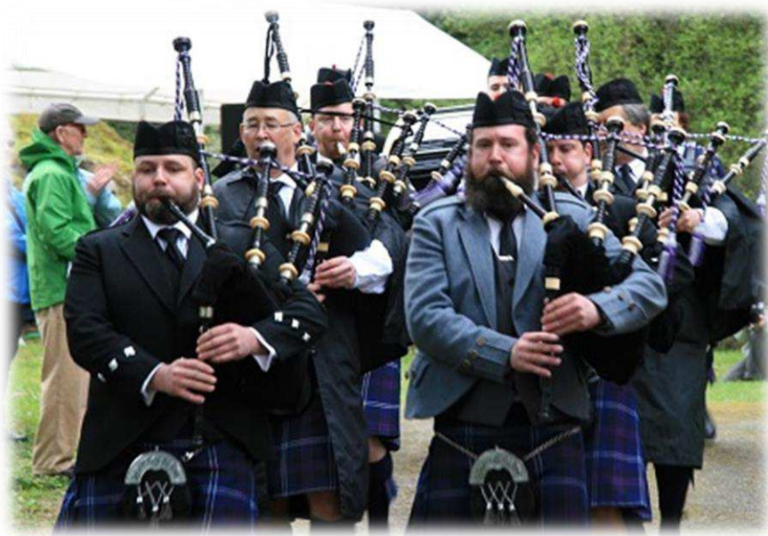
Caledonia Pipe Band