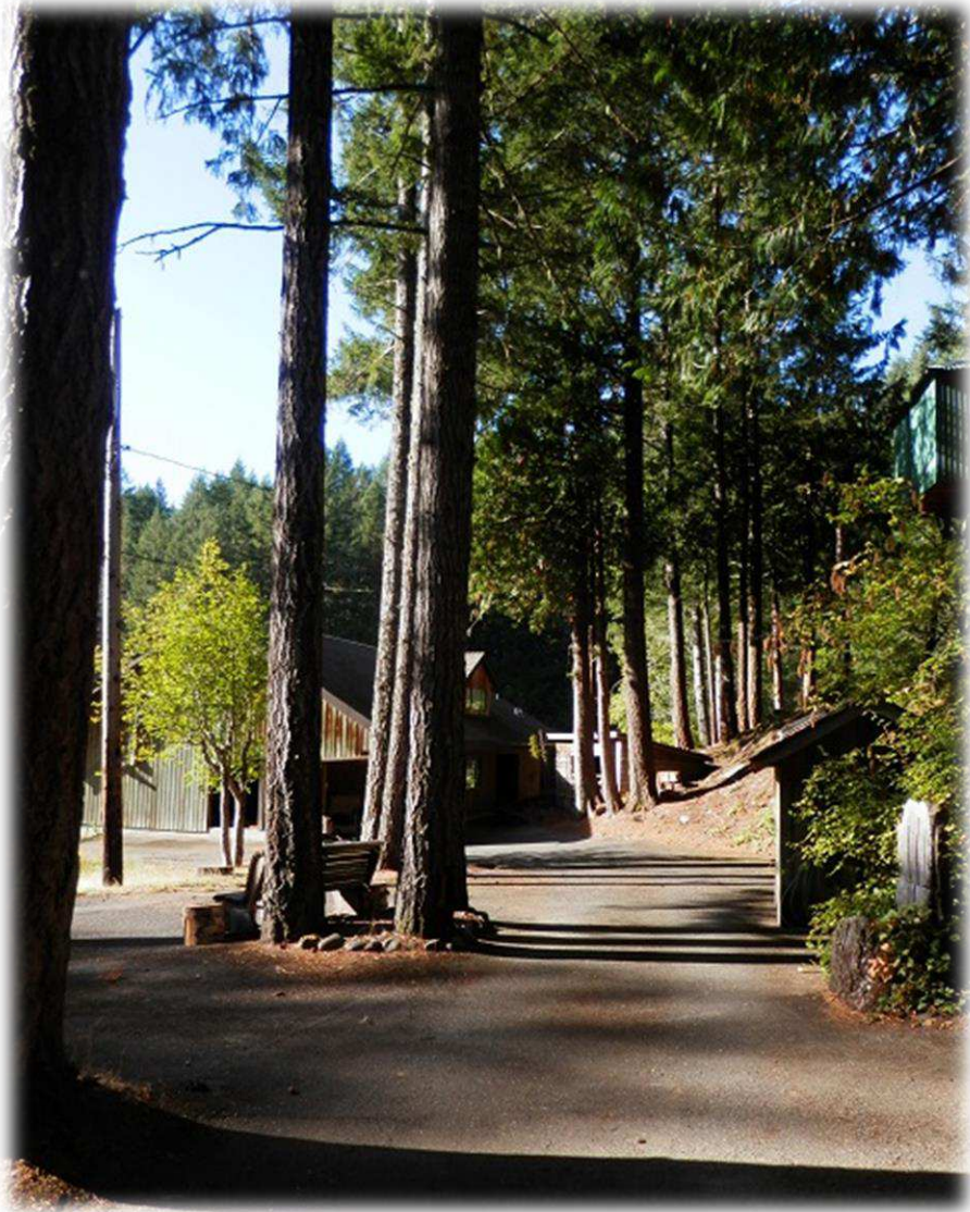
Trees Trimmed near Nature House for Fire Safety