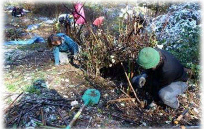
Greater Victoria Green Team Volunteers