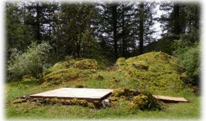
Broom free with new stage