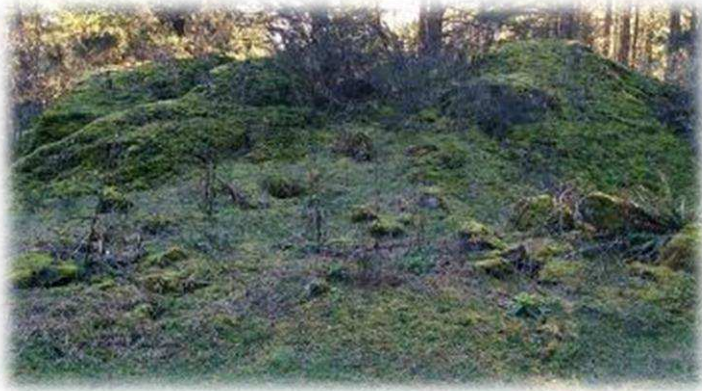
Broom near east lake